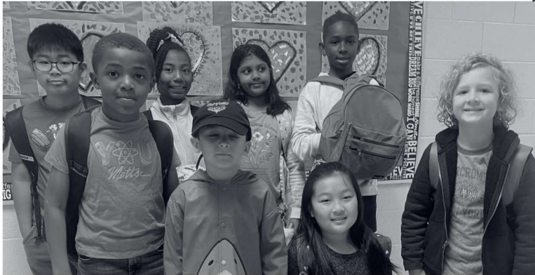
Our Eclectic Community

told me, people of indigenous, African, and even European heritage." That sounds like a rich culture bursting with color and flavor. Meanwhile, a student from the Dominican Republic told me, "Our country believes in Roman Catholicism and other christian denominations." That was something I never knew. A Sri Lankan student told me, "Our culture is known for cricket, holistic medicine, religious icons such as the Buddhist flag, and other cultural exports