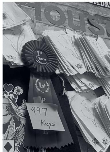
The House book count

While there won't be another reading competition for quite some time, we sincerely hope that people will be reading a lot during summer vacation. So good luck to everyone, and make sure to do your BES-T.