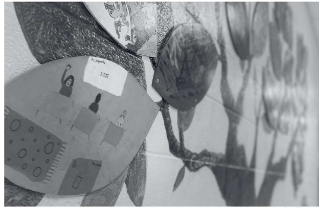
The Character Tree