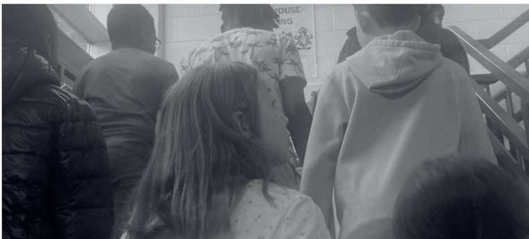
Ballantyne Students on their way to class