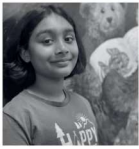
LEAD ILLUSTRATOR MEENAKSHI SUMAL